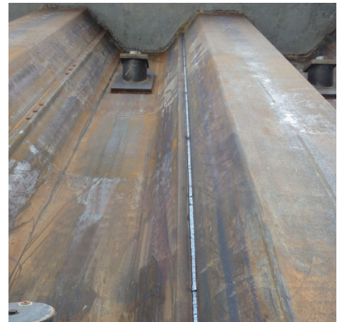
Anchors front assembly / Seal-welding in EXC 3

Construction started in 2014 and the project is expected to finish in 2016.