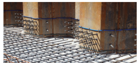
Detailing to assure impermeability of the connection between bottom slab and sheet pile interface

ArcelorMittal Commercial RPS S.à r.l. Sheet Piling | 66, rue de Luxembourg L-4221 Esch-sur-Alzette | Luxembourg T (+352) 5313 3105 sheetpiling@arcelormittal.com sheetpiling.arcelormittal.com