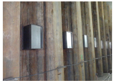
Maintenance boxes for inspection of anchorage