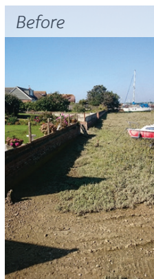
Reach E1: HZ/AZ installation from a jack-up barge