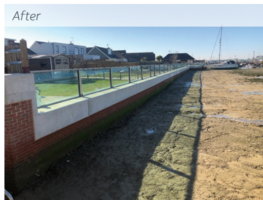
Reach W3: Before and After