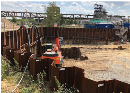
Excavating contaminated soil

In conclusion, steel sheet piling is the best solution here to ensure the safety of the excavation pit. It allows precise work and control of the project progress.