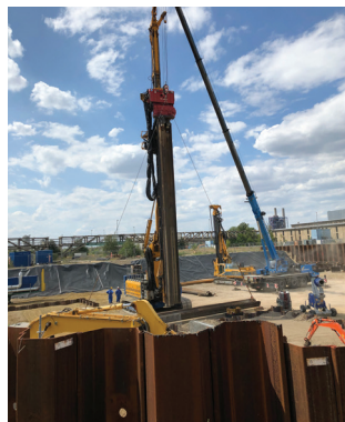
Pile driving equipment