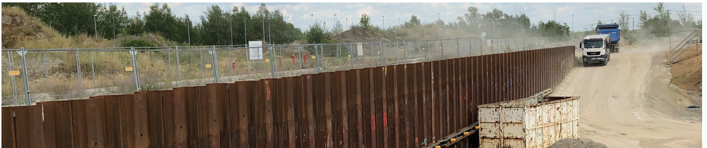
Main access ramp and anchored sheet piles retaining wall

The primary pit enclosure is first executed using anchored sheet piles. Heavy equipment can access the pit via long access ramps. Secondary pits are then executed within these closed areas, from which the contaminated soil will be gradually removed. When executing the secondary pits, a flexible strutting system is used to allow for easy dismantling after backfilling and adjustments during driving. More than 1.3 km of sheet piles will be installed. It is planned from the start to reuse the sheet piles several times. For this reason, the client opted for the PU 22 -1