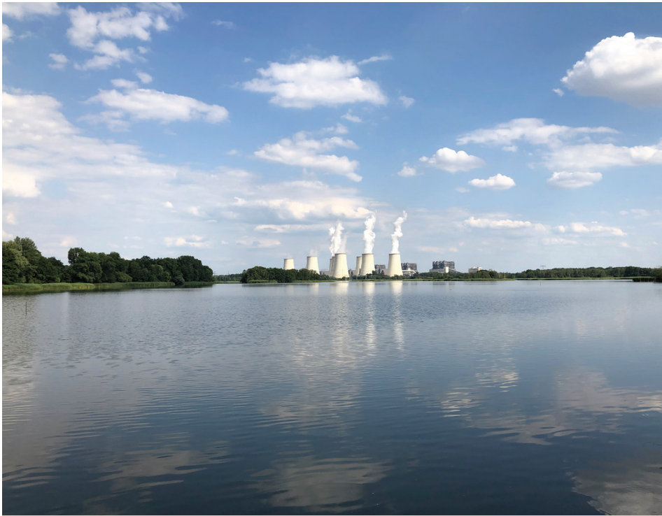
The “Schwarze Pumpe” industrial site in Spremberg, Germany

The “Schwarze Pumpe” industrial park is located about 120 km (75 miles) southeast of Berlin, in Spremberg, in the federal states of Brandenburg and Saxony. The site was established in 1955 under the name “VEB Gaskombinat Schwarze Pumpe” to exploit the brown coal mined nearby for power generation and refining into briquettes for domestic heating. This included gas production plants, coking plants, combined heat and power plants and briquette plants on the site, all interconnected with the necessary auxiliary facilities.