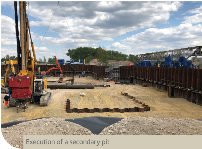
Execution of a secondary pit