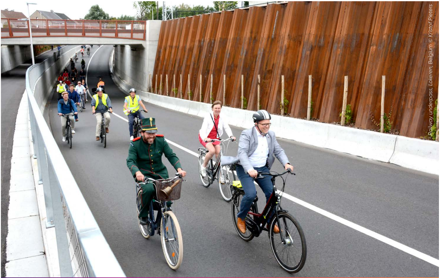
Railway underpass, Lokeren, Belgium