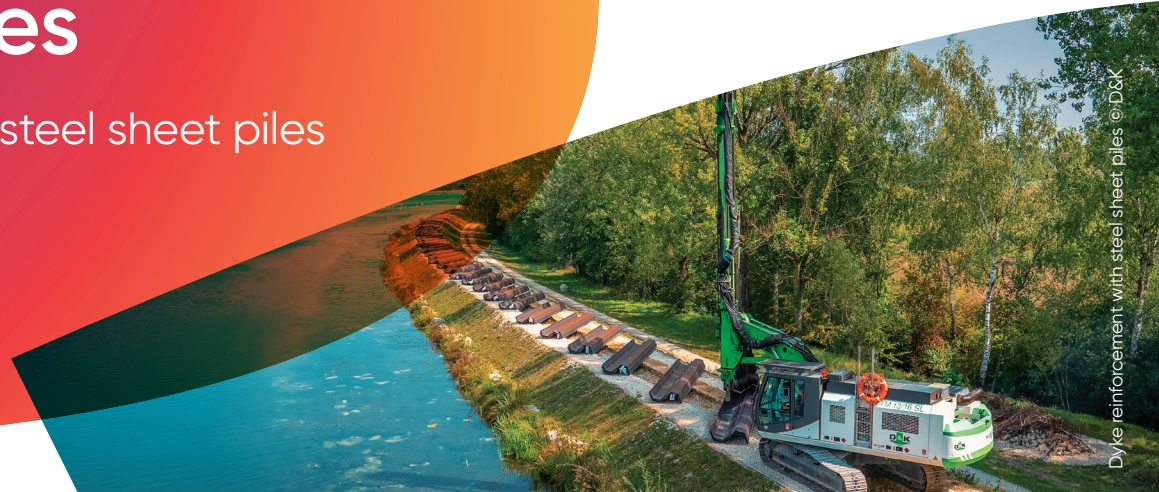
Dyke reinforcement with steel sheet piles